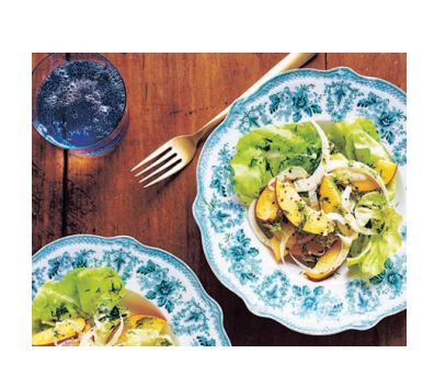
SALAD OF THE SUMMER Nectarine. Fennel. And two drizzly dressings D6